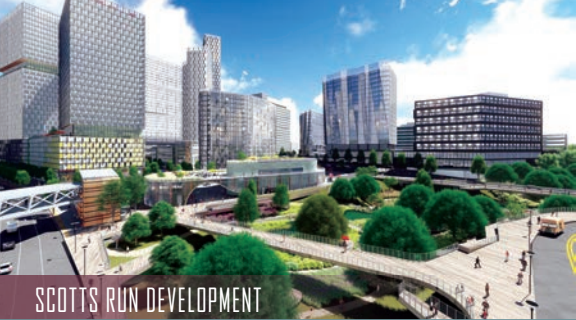
SCOTTS RUN DEVELOPMENT