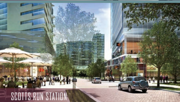
SCOTTS RUN STATION