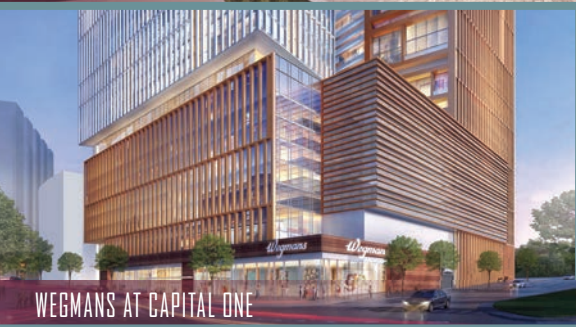
WEGMANS AT CAPITAL ONE